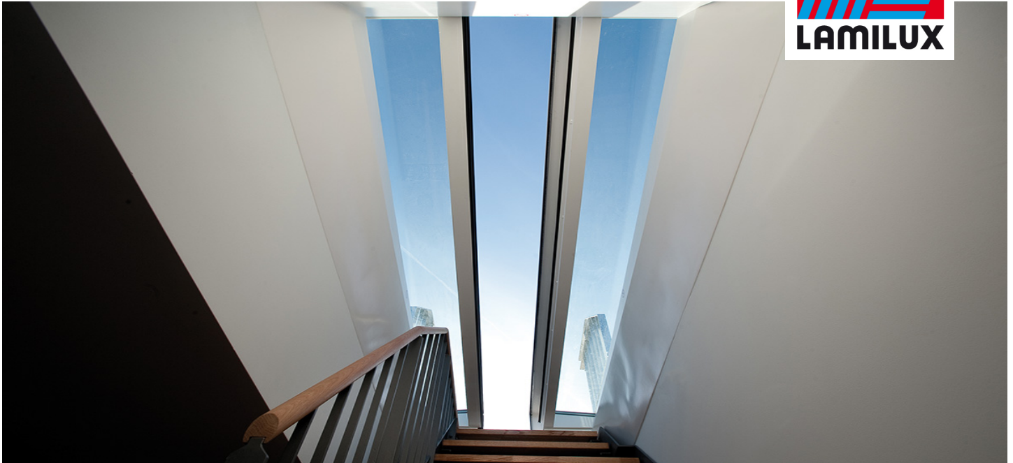
Top floor apartment in the centre of Berlin