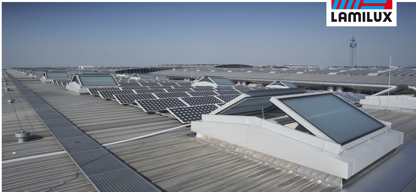
Exhibition Hall A4, Munich