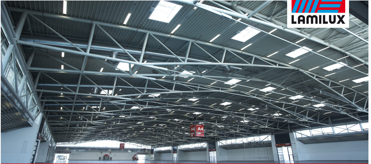
Exhibition Hall A4, Munich