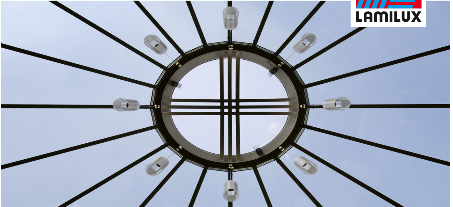
Embassy of Kazakhstan, Berlin