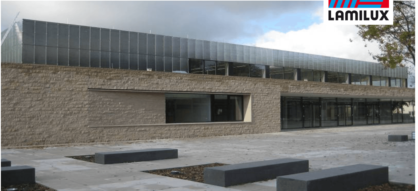
Multipurpose Hall Schillerhalle, Dettingen