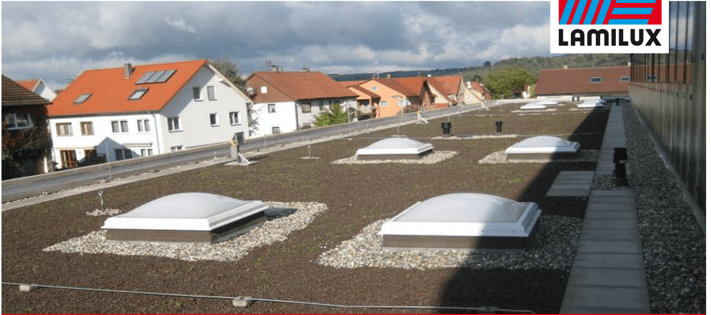
Multipurpose Hall Schillerhalle, Dettingen