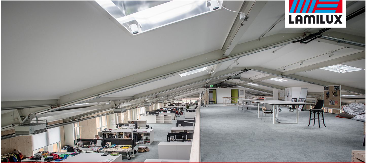
VauDe, Tett nang