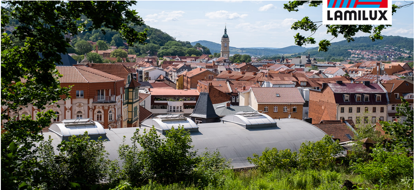
Climbing Hall, Eisenach (Germany)