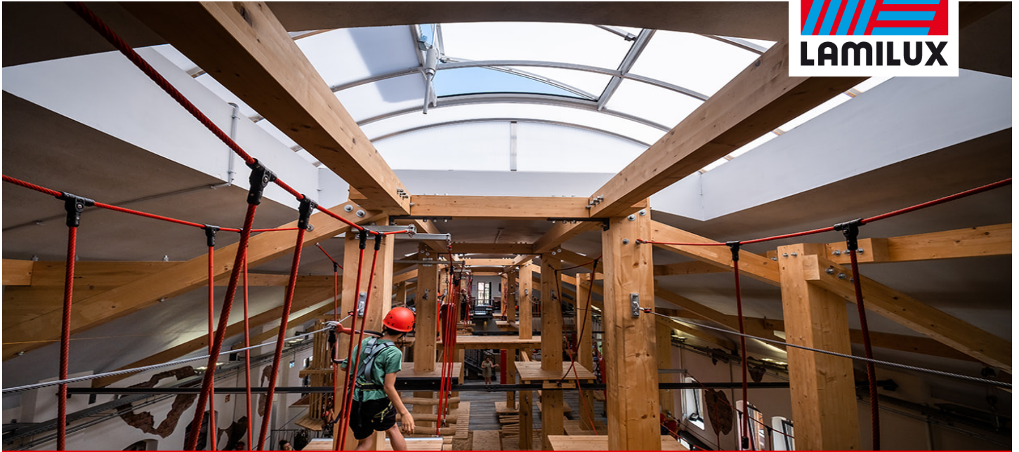
Climbing Hall, Eisenach (Germany)