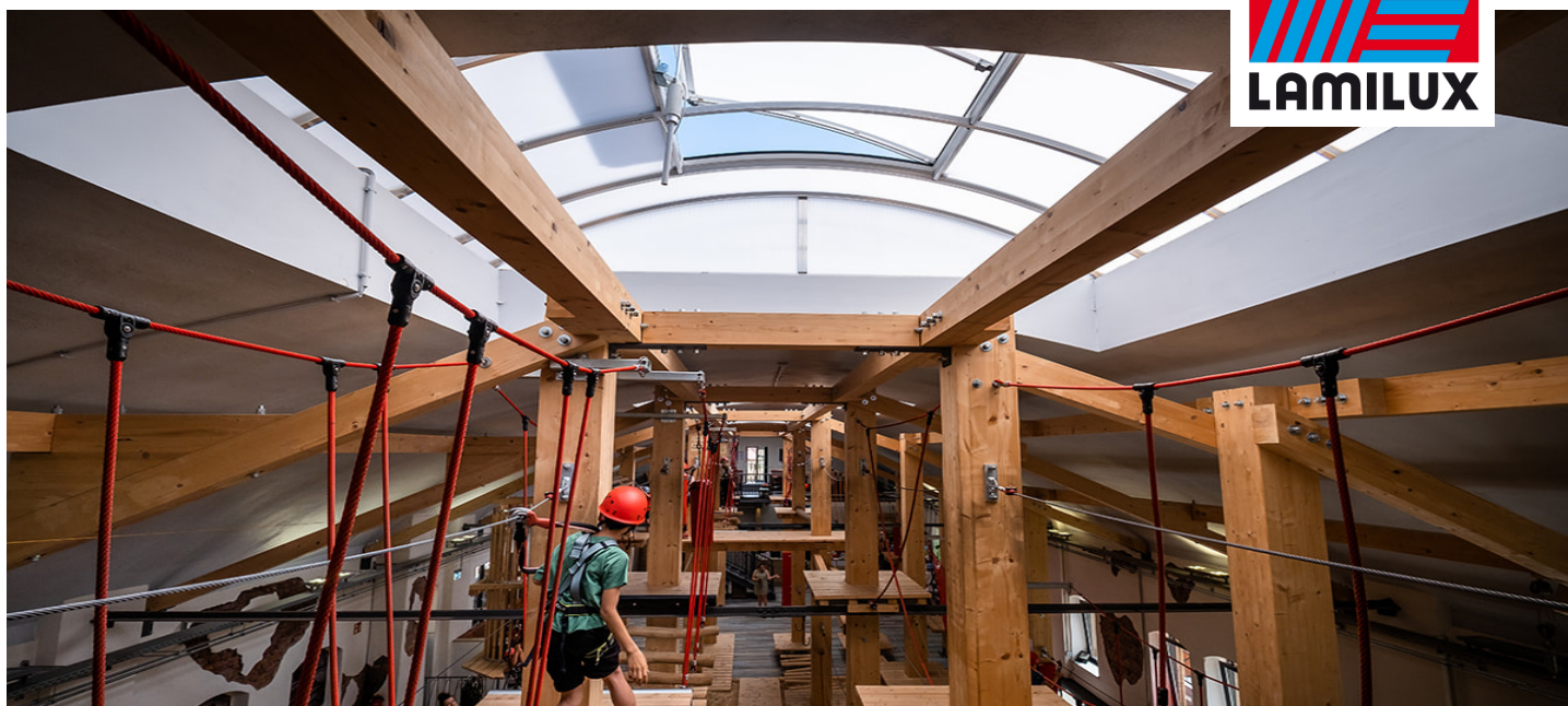
Climbing Hall, Eisenach (Germany)